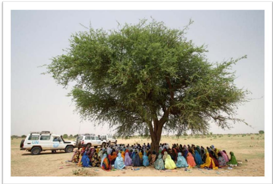
A meeting with returnees in Borota, eastern Chad. The key concern discussed was the lack of clean water.