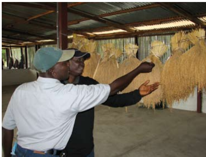
Technicians observing panicles of different rice varieties

to mature while there is sufficient moisture for grain filling. Adaptation to soil, soil fertility, diseases, pests, day length and moisture regimes are all important characteristics of a crop variety.