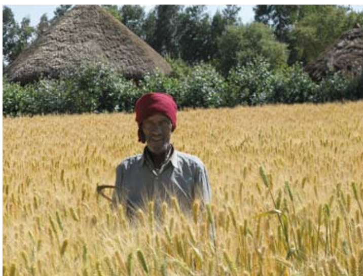
Farmer in his wheat seed production field in Ethiopia

FAO and its member countries have developed a system of quality assurance, the Quality Declared Seeds (QDS), which is not as rigorous as the OECD seed certification procedures. The purpose of QDS is to have a realistic quality assurance process and standards for seeds in countries that are at the initial stages of seed industry development. It also provides standards for crops that do not feature prominently in international seed trade despite the importance of these crops for food security in less developed countries. FAO insists that seeds used in seed relief activities should at least meet and hopefully exceed QDS standards (Annex 3). IPs and emergency staff should also be aware that some countries have specific quality standards for seed distributed in emergency situations, which can be higher than those of QDS.