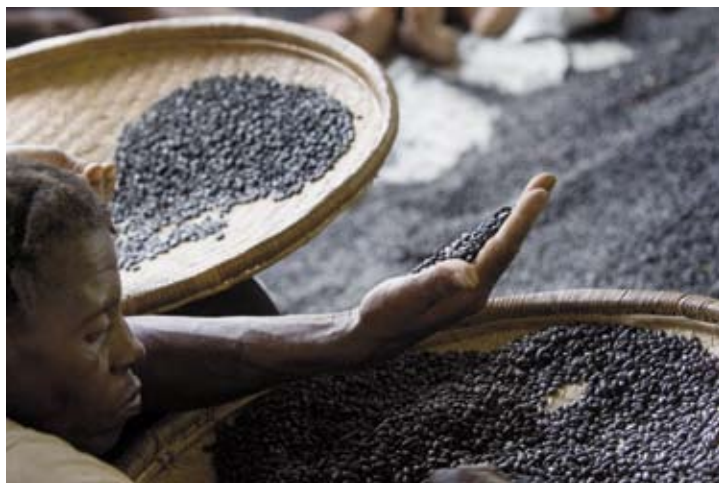
Farmers cleaning bean seed in Haiti

Physical quality parameters such as seed uniformity, extent of inert material content and discoloured seed can be detected by visually examining seed samples.