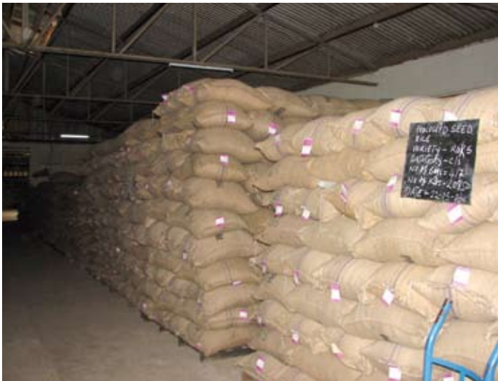
Seed must be stored properly to limit seed deterioration. Here, seeds are stored on pallets to prevent humidity from migrating in the bags.