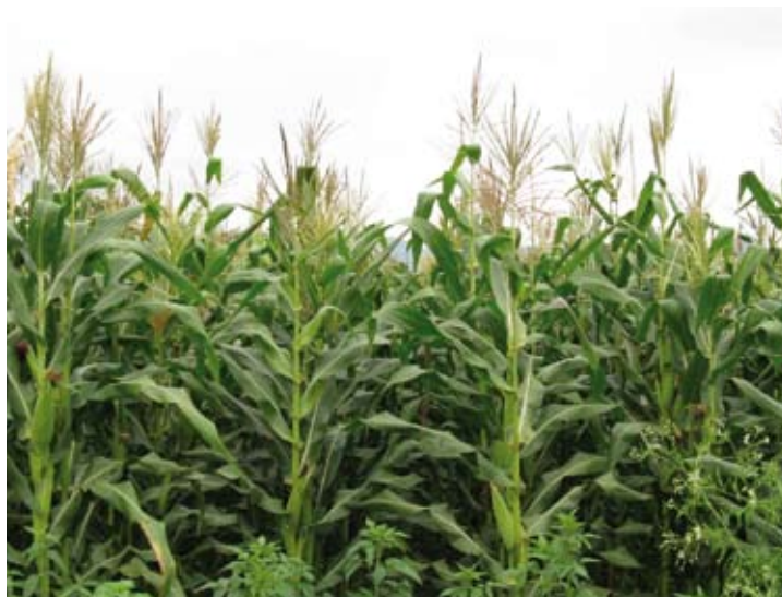
Male flowers of maize—producing pollen that will generally pollinate female flowers of other plants of maize. The resulting cob will carry seed of a hybrid of the two plants.

Hybrids are produced by the cross-pollination of unlike parents of the same crop. In very simple terms, parent plants are selected for certain traits and are self-pollinated for several generations to produce “inbred lines”. These inbred lines are then cross-pollinated to produce the F1 generation, which is known as a hybrid. Because the parents are genetically dif-