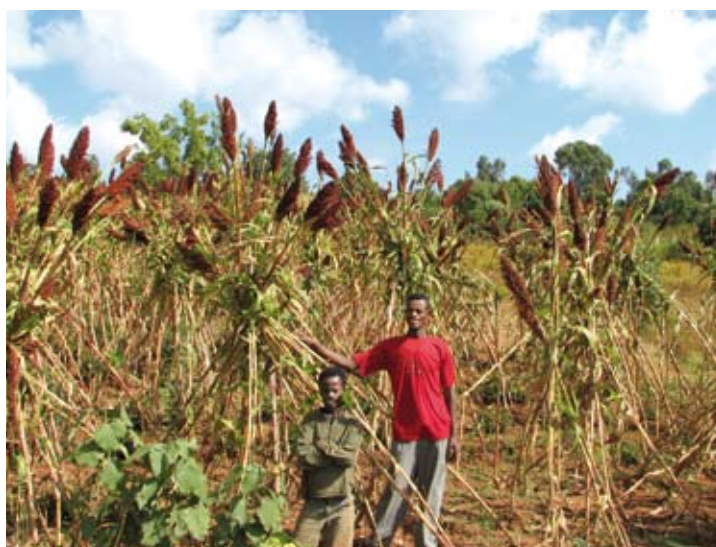
Farmers generally prefer local landraces of sorghum in Ethiopia

However, there is an element of risk when you consider the difference between seed and food grain. Food grain can be damaged and broken seed, not uniform in size, low in germination, and a mixture of varieties, and yet be acceptable for sale or consumption, but which would not be good for planting. Seed for planting must be able to germinate and produce