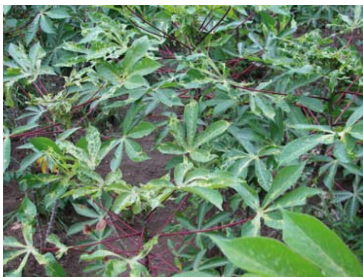
An example of symptoms of disease in a cassava field. If material from this field is used for emergency relief, the recipient farmers' fields will be infested as well.

In emergency interventions, the most common vegetative planting materials are plantain/banana suckers, sweet potato cuttings, potato tubers, cassava cuttings and a wide range of fruit tree seedlings. For most locations where these are needed, a knowledge of horticulture is often sufficient to offer guidelines on suitable varieties or cul-