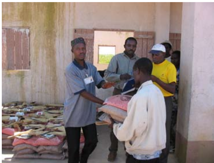
Seed distribution in Angola

Local procurement has the flexibility to allow purchases at the local markets from farmers and small suppliers who may not be able to respond to a tender. The national seed system (Annex 4) is important to consider when purchasing seed at the country level. In some countries, there is a seed industry with adapted local crop