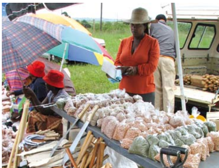
A seed fair in Swaziland

The use of market-based approaches for emergency seed distribution has been well documented 6 . There is great interest in this approach because it offers farmers a choice in the seed and other inputs they receive and because it creates links between the beneficiaries and the local seed systems, both