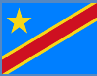
Democratic Republic of Congo, North Kivu