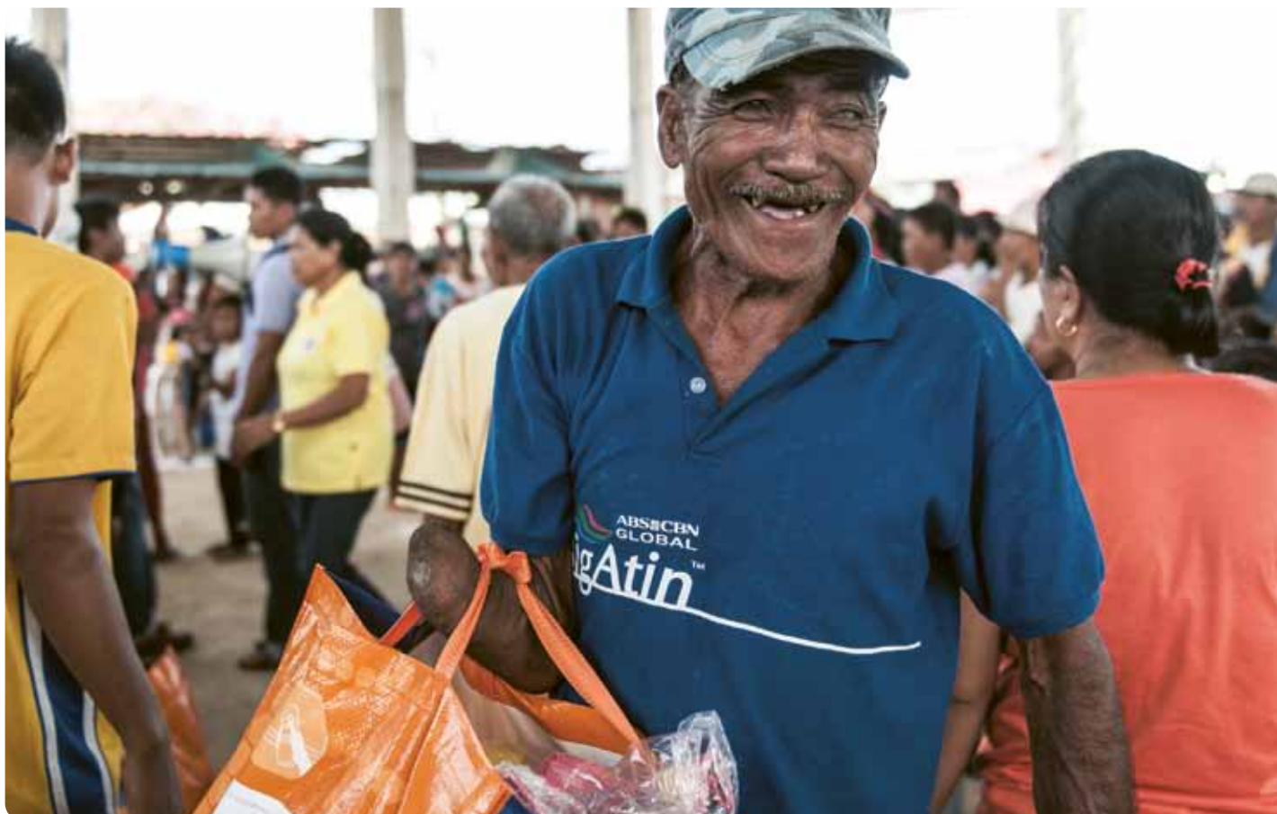
A man having just received emergency relief items, Concepcion, Panay Island, the Philippines after typhoon Haiyan, November 2013.

This pilot version of the Minimum Standards for Age and Disability Inclusion in Humanitarian Action was published by the Age and Disability Consortium, a group of seven agencies working to promote age and disability inclusive humanitarian assistance: CBM, DisasterReady.org, Handicap International, HelpAge International, IFRC, Oxford Brookes University and RedR UK.